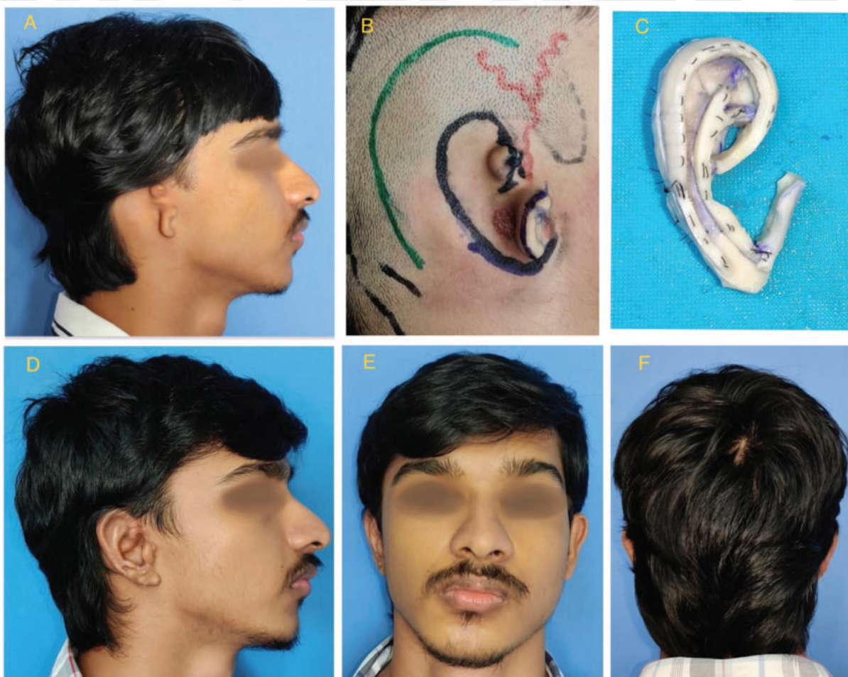
Fig. 2 A 19-year-old male with right lobule type microtia (A). Preoperative markings of subcutaneous pocket, lobule splitting incision, template, and superficial temporal artery (B) and a framework fabricated with 4-0 Nylon (C) result in the lateral, anterior, and posterior (D, E, and F) views 1.5 years post surgery.

When the opposite ear is prominent and hinders symmetry, contralateral otoplasty is a solution, but in our experience, patients generally do not opt for it.