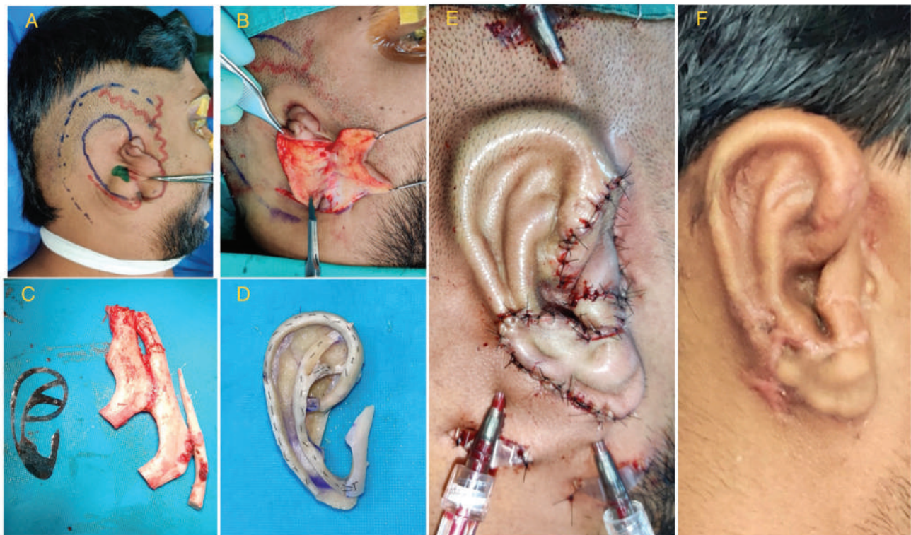
Fig. 1 First stage of microtia reconstruction: preoperative marking (A); split lobule with fine vessels preserved at base of flap (B); 6, 7, and 8 costal cartilages harvested (C); cartilage framework (D); immediate postoperative result—note suction drain system created using 16G cannulas (E); and final result 1.5 years later (F).

Position of auricle and skin incision for pocket creation are marked (→ Fig. 1). Pocket creation and cartilage harvest are done simultaneously with two-team approach.