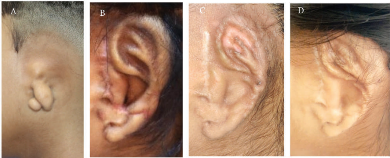
Fig. 6 A 13-year-old girl with lobule type microtia (A). Post stage 1 reconstruction; stable result for about a year (B). Late extrusion of multiple stainless steel wires (C). Resorbed cartilage after 2 years (D).