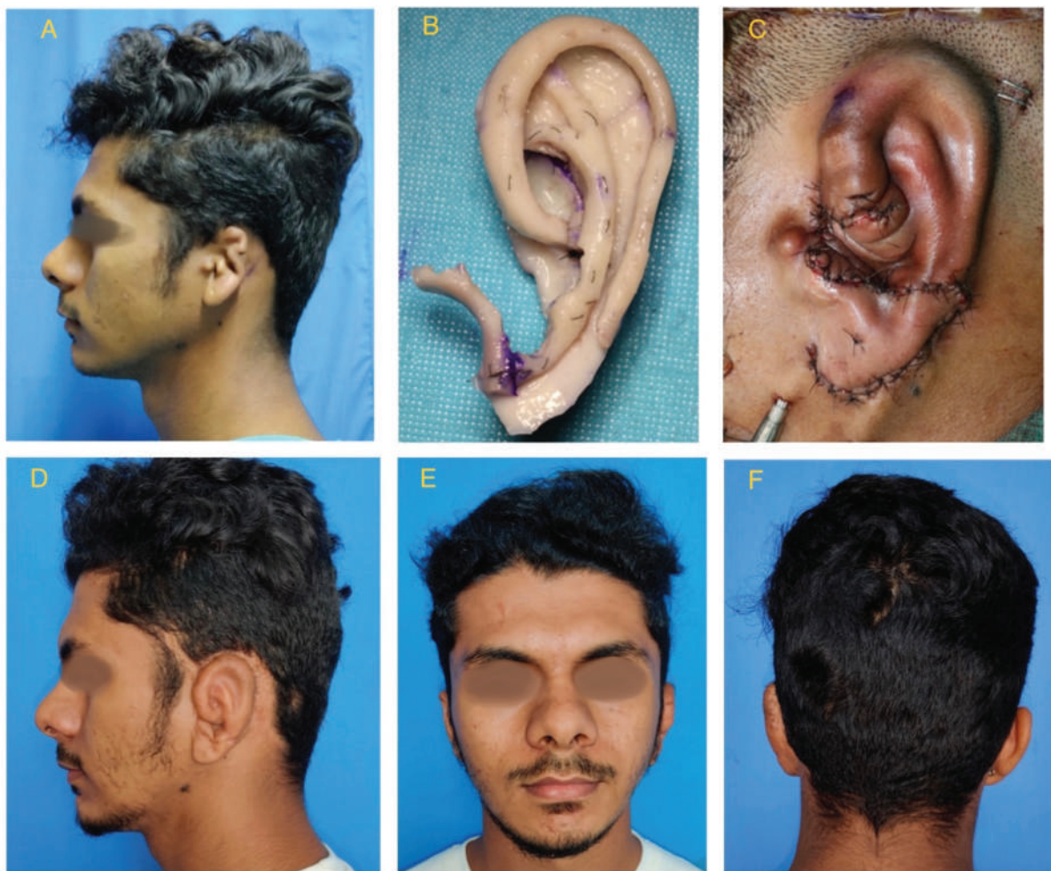
Fig. 7 An 18-year-old male with left lobule type microtia (A). Framework fabricated using both stainless steel wires and nylon sutures (B). Immediate postoperative result (C). Secondary corrections and second-stage elevation are depicted in ►Figs. 4 and 5. Result after 2.5 years after both stages of reconstruction (D, E, and F).