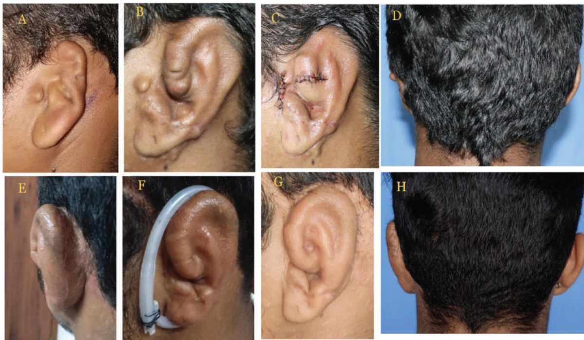
Fig. 5 An 18 year old male with left lobule type microtia (A). Result after stage 1 reconstruction (B). Secondary correction 3 months after the first stage (C). Note the inadequate projection after stage 1 (D). Result after second stage, that is, framework elevation (done 6 months after the first stage) (E). Silicone ring splint (F). Final appearance without splint (G). The final result 7.5 years post surgery, note improvement in projection (H).

Auricular reconstruction presents a surgical challenge because of the complexity of the normal ear structure.