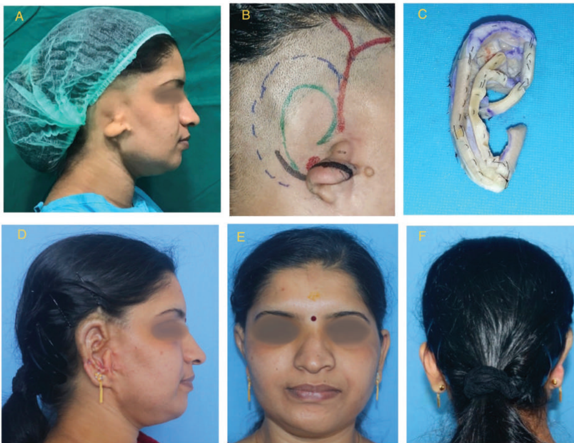
Fig. 3 A 28-year-old lady with right lobule type microtia (A). Preoperative markings of subcutaneous pocket, incision to transpose lobule, template, and superficial temporal artery (B) and a multipiece framework fabricated with 4-0 Nylon (C) result in the lateral, anterior, and posterior (D, E, and F) views 1.5 years post surgery.

If the primary framework projection is not adequate, the second stage is performed after 6 months of the primary surgery.