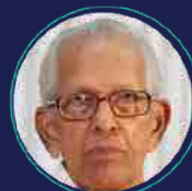
PROF. M. K. SANU